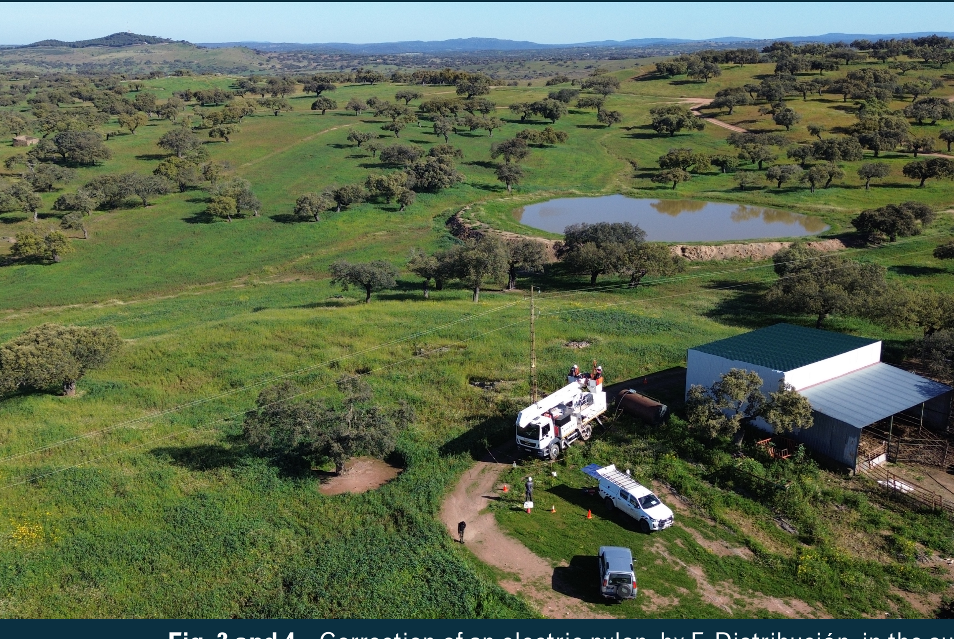
Fig. 3 and 4 – Correction of an electric pylon, by E-Distribución, in the surroundings of the releasing area.