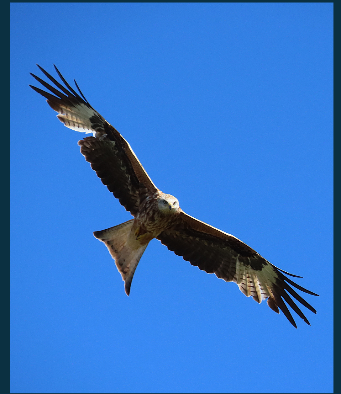
Fig. 2 – Wild red kite, in the SW of Spain.